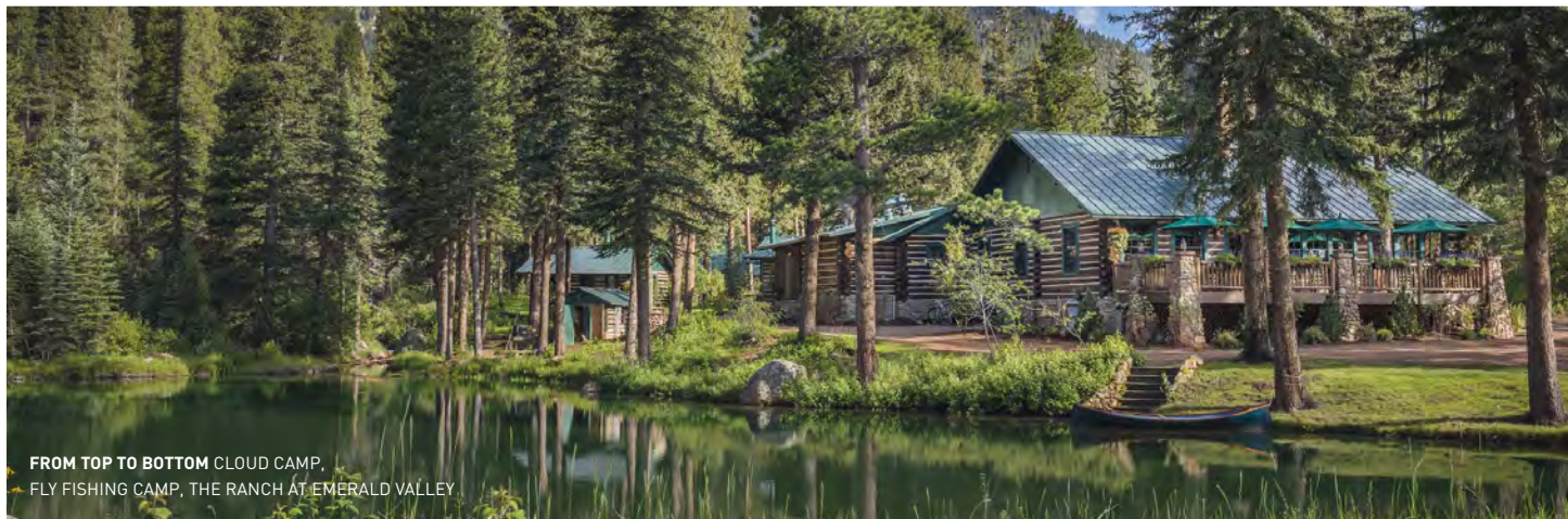
FROM TOP TO BOTTOM CLOUD CAMP, FLY FISHING CAMP, THE RANCH AT EMERALD VALLEY